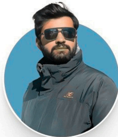
Harsh (Stock Market)